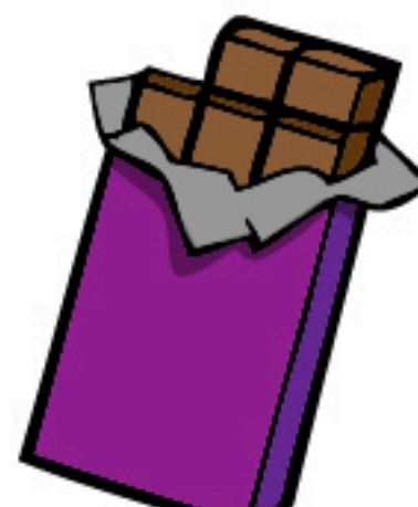
CHOCOLATES [ S ]