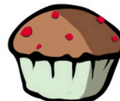
MUFFINS [ E ]