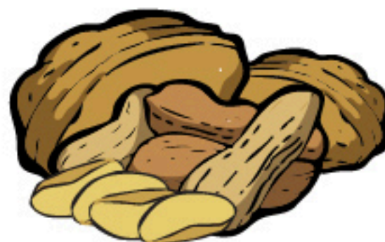
MIXED NUTS [ E ]