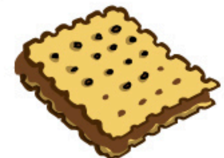
PEANUT BUTTER & CRACKERS [ E ]