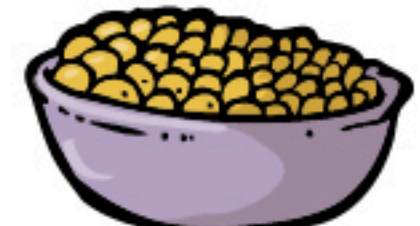
CEREAL [ E ]