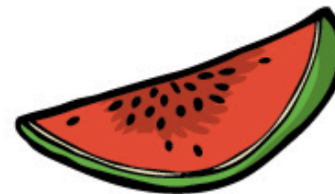
WATERMELON [ E ]