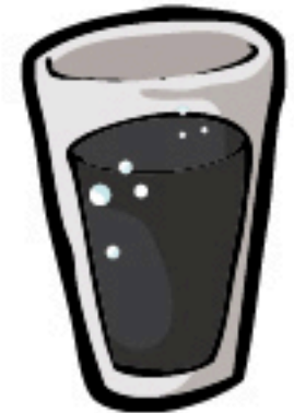
SODA [ S ]