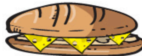
CHEESE SANDWICH [ E ]