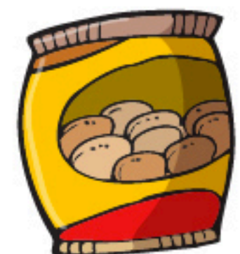
POTATO CHIPS [ S ]