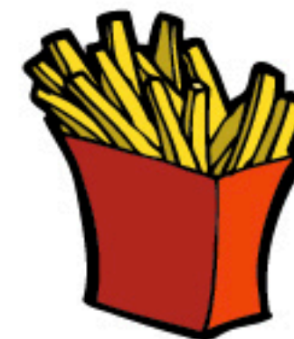
FRENCH FRIES [ S ]