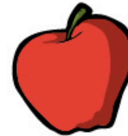
APPLES [ E ]