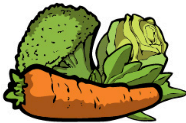
VEGETABLES [ E ]