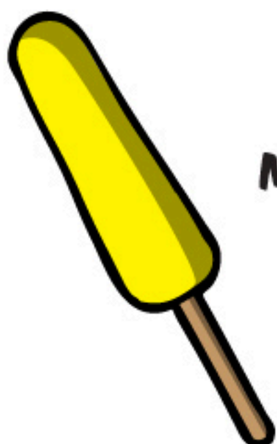
POPSICLES [ S ]